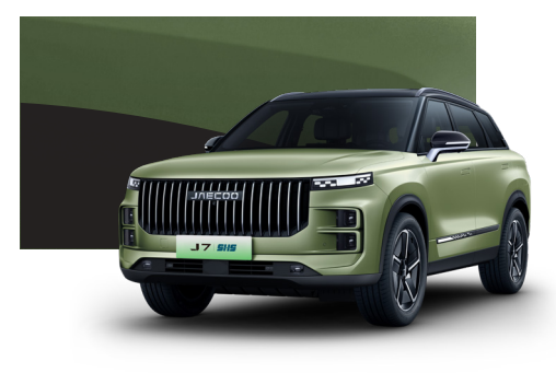
Forest Green with Carbon Black Roof*